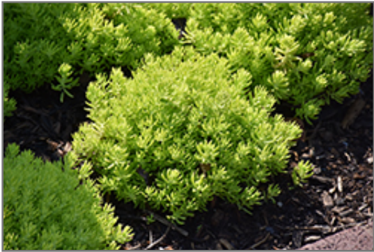
Lemon Coral Stonecrop