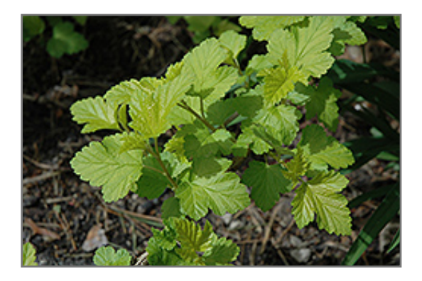
Common Ninebark foliage