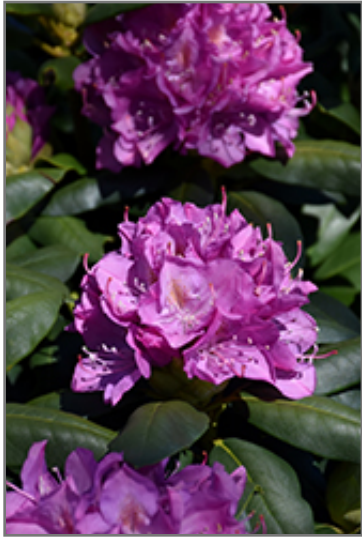
Roseum Elegans Rhododendron flowers