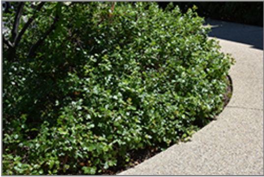
Gro-Low Fragrant Sumac

Gro-Low Fragrant Sumac is recommended for the following landscape applications;