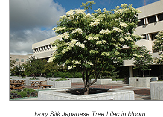
lvory Silk Japanese Tree Lilac in bloom