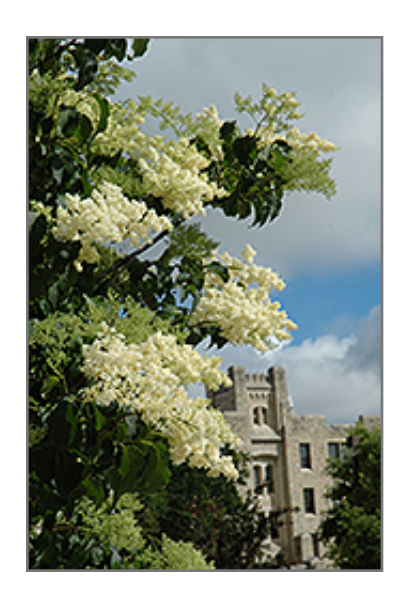
Ivory Silk Japanese Tree Lilac flowers