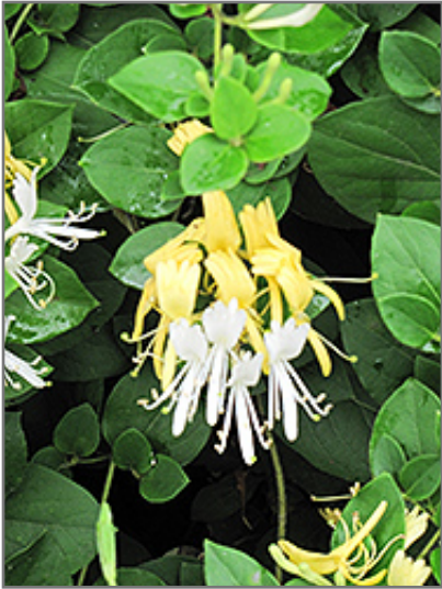
Hall's Japanese Honeysuckle flowers