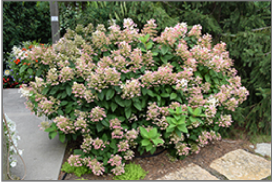
Little Quick Fire Hydrangea in bloom