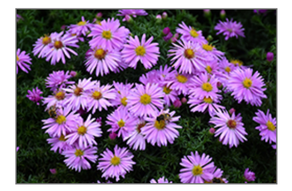
Woods Pink Aster flowers