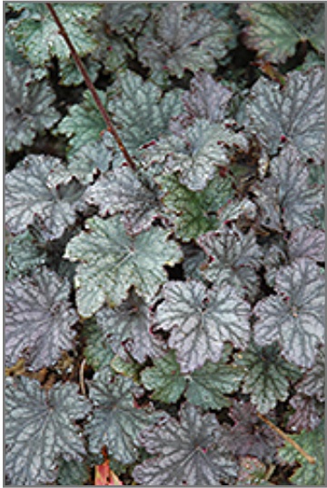
Frosted Violet Coral Bells foliage

This is a relatively low maintenance plant, and should be cut back in late fall in preparation for winter. It is a good choice for attracting hummingbirds to your yard. It has no significant negative characteristics.