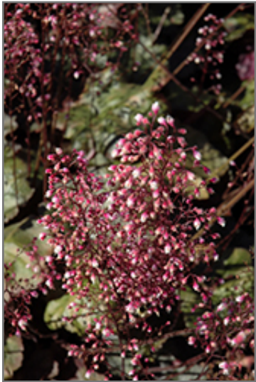
Frosted Violet Coral Bells flowers