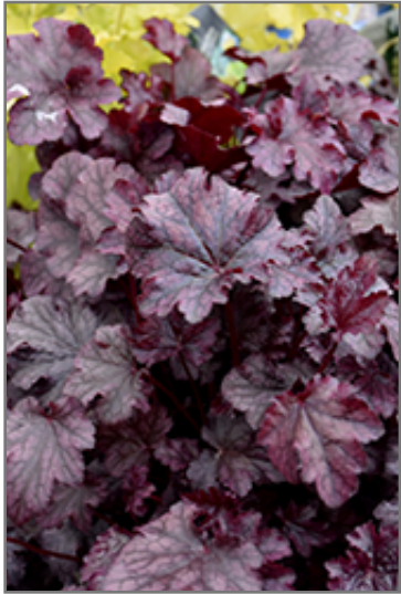
Plum Pudding Coral Bells foliage

Plum Pudding Coral Bells is recommended for the following landscape applications;