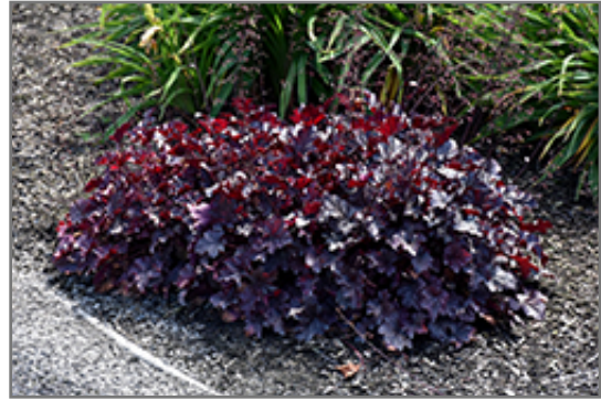
Plum Pudding Coral Bells

Plum Pudding Coral Bells will grow to be only 6 inches tall at maturity extending to 12 inches tall with the flowers, with a spread of 12 inches. When grown in masses or used as a bedding plant, individual plants should be spaced approximately 10 inches apart. Its foliage tends to remain low and dense right to the ground. It grows at a medium rate, and under ideal conditions can be expected to live for approximately 10 years. As an evergreen perennial, this plant will typically keep its form and foliage year-round.