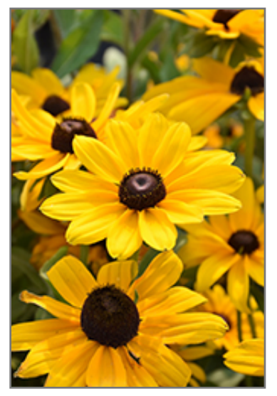
Indian Summer Coneflower flowers