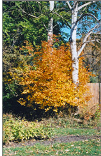
Saskatoon in fall