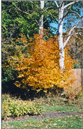
Saskatoon in fall