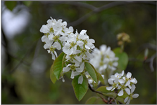
Saskatoon flowers

Saskatoon is a multi-stemmed deciduous shrub with an upright spreading habit of growth. Its relatively fine texture sets it apart from other landscape plants with less refined foliage.