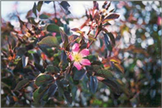
Red Leaf Rose flowers

This is a high maintenance shrub that will require regular care and upkeep, and is best pruned in late winter once the threat of extreme cold has passed. It is a good choice for attracting bees to your yard. Gardeners should be aware of the following characteristic(s) that may warrant special consideration;