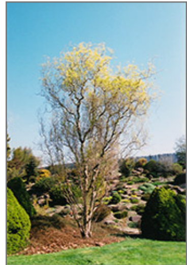
Dragon's Claw Willow in winter