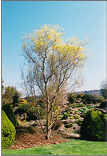
Dragon's Claw Willow in winter