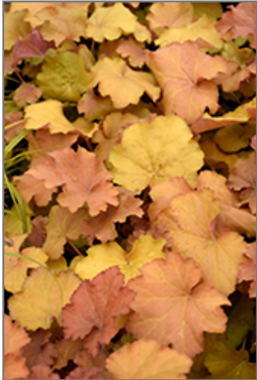
Caramel Coral Bells foliage

Caramel Coral Bells is recommended for the following landscape applications;