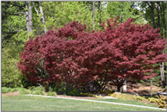
Suminagashi Japanese Maple