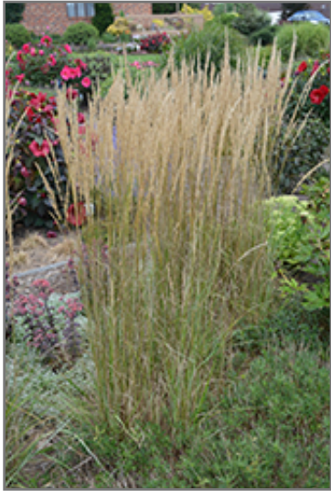
El Dorado Feather Reed Grass

El Dorado Feather Reed Grass is recommended for the following landscape applications;