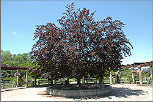
Purple Beech