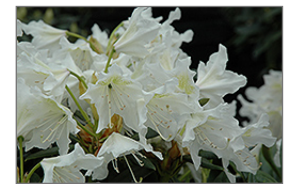
Cunningham White Rhododendron flowers