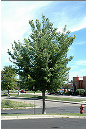
Common Hackberry