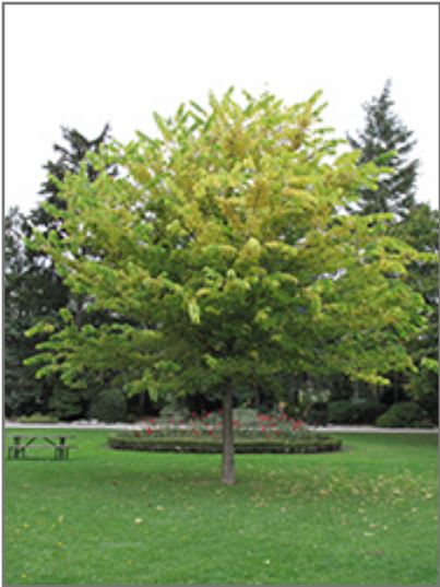
Common Hackberry in fall