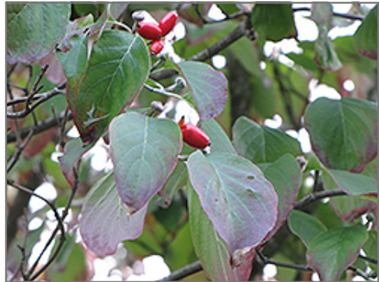
Cherokee Chief Flowering Dogwood fruit

This tree does best in full sun to partial shade. You may want to keep it away from hot, dry locations that receive direct afternoon sun or which get reflected sunlight, such as against the south side of a white wall. It requires an evenly moist well-drained soil for optimal growth, but will die in standing water. It is very fussy about its soil conditions and must have rich, acidic soils to ensure success, and is subject to chlorosis (yellowing) of the foliage in alkaline soils. It is quite intolerant of urban pollution, therefore inner city or urban streetside plantings are best avoided, and will benefit from being planted in a relatively sheltered location. Consider applying a thick mulch around the root zone in winter to protect it in exposed locations or colder microclimates. This is a selection of a native North American species.