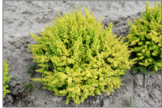
Sunsation Japanese Barberry

Sunsation Japanese Barberry is recommended for the following landscape applications;