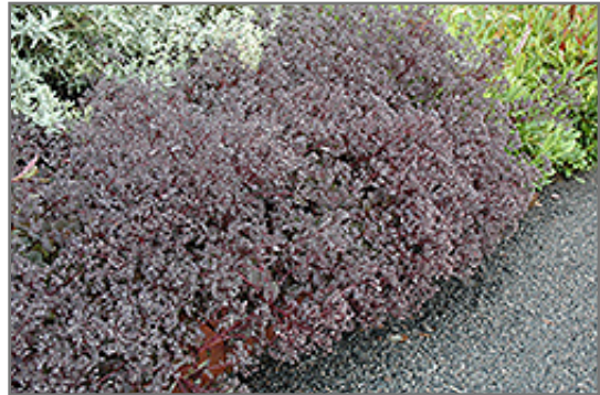
Bertram Anderson Stonecrop