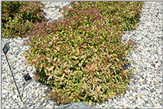
Flaming Mound Spirea