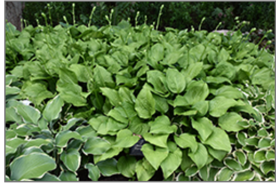
Royal Standard Hosta

Royal Standard Hosta is recommended for the following landscape applications;