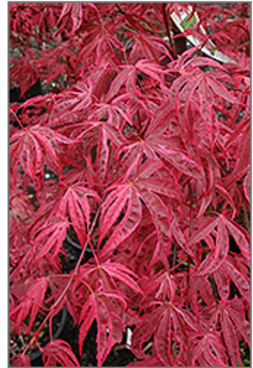
Shirazz Japanese Maple foliage