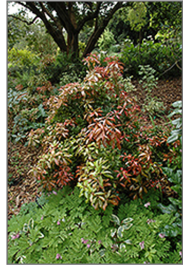
Mountain Fire Japanese Pieris

This shrub does best in full sun to partial shade. It requires an evenly moist well-drained soil for optimal growth, but will die in standing water. It is very fussy about its soil conditions and must have rich, acidic soils to ensure success, and is subject to chlorosis (yellowing) of the foliage in alkaline soils. It is somewhat tolerant of urban pollution, and will benefit from being planted in a relatively sheltered location. Consider applying a thick mulch around the root zone in winter to protect it in exposed locations or colder microclimates. This is a selected variety of a species not originally from North America, and parts of it are known to be toxic to humans and animals, so care should be exercised in planting it around children and pets.