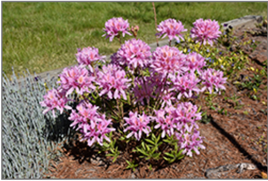
Orchid Lights Azalea in bloom