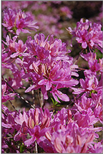
Orchid Lights Azalea flowers