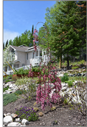
Royal Beauty Flowering Crab in bloom

This shrub should only be grown in full sunlight. It prefers to grow in average to moist conditions, and shouldn't be allowed to dry out. It is not particular as to soil type or pH. It is highly tolerant of urban pollution and will even thrive in inner city environments. This particular variety is an interspecific hybrid.