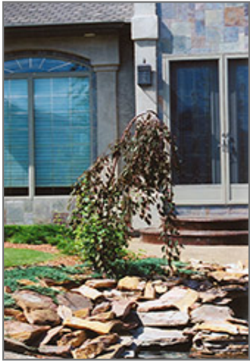
Royal Beauty Flowering Crab