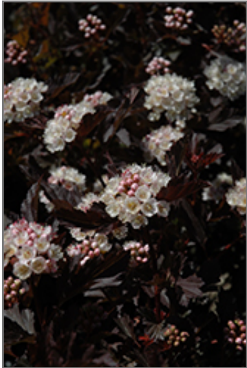
Tiny Wine Ninebark flowers

This shrub will require occasional maintenance and upkeep, and can be pruned at anytime. It has no significant negative characteristics.