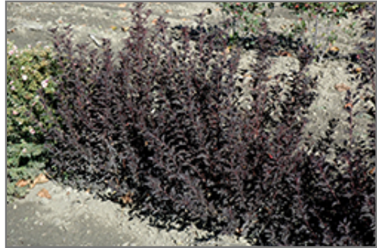
Tiny Wine Ninebark

This shrub does best in full sun to partial shade. It is very adaptable to both dry and moist locations, and should do just fine under average home landscape conditions. It is not particular as to soil type or pH. It is highly tolerant of urban pollution and will even thrive in inner city environments. This is a selection of a native North American species.