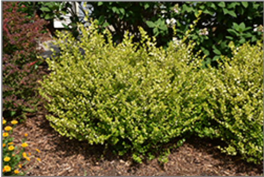
Cesky Gold Dwarf Birch