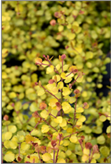
Cesky Gold Dwarf Birch foliage