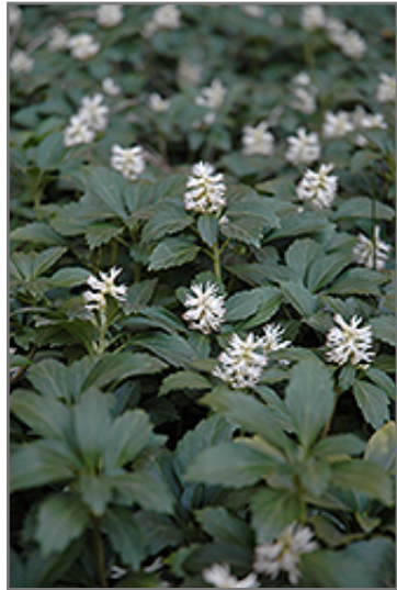
Japanese Spurge flowers