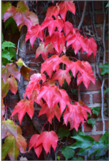
Boston Ivy in fall