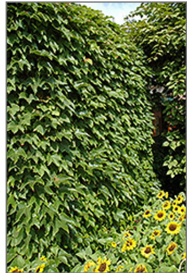
Boston Ivy

This woody vine does best in full sun to partial shade. It is very adaptable to both dry and moist locations, and should do just fine under average home landscape conditions. It is considered to be drought-tolerant, and thus makes an ideal choice for xeriscaping or the moisture-conserving landscape. It is not particular as to soil type or pH, and is able to handle environmental salt. It is highly tolerant of urban pollution and will even thrive in inner city environments. This species is not originally from North America.