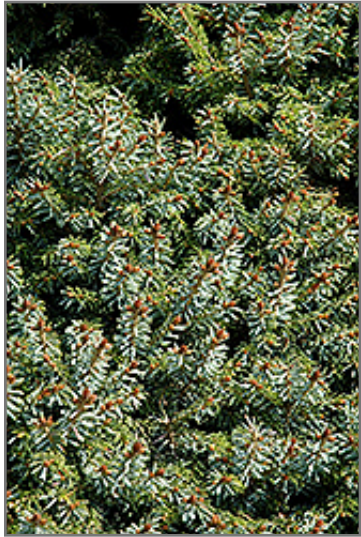
Dwarf Serbian Spruce foliage