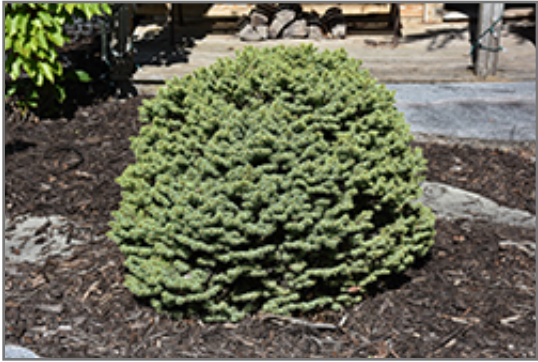
Dwarf Serbian Spruce