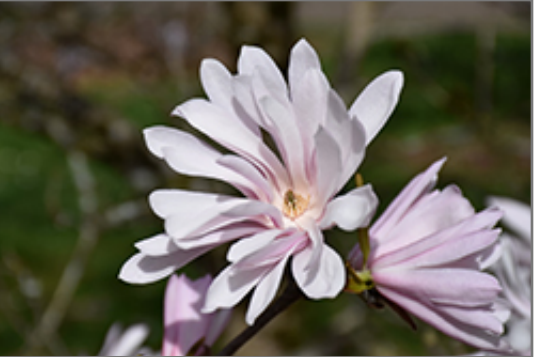
Jane Platt Star Magnolia flowers

featuring fragrant, star-shaped light pink double flowers in early spring with numerous petals, upright and multi-stemmed; quite hardy, although flowers may be occasionally lost to late spring frosts