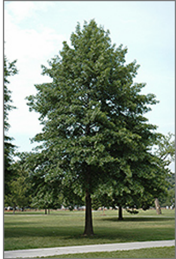
Pin Oak