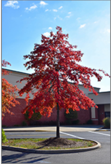
Pin Oak in fall