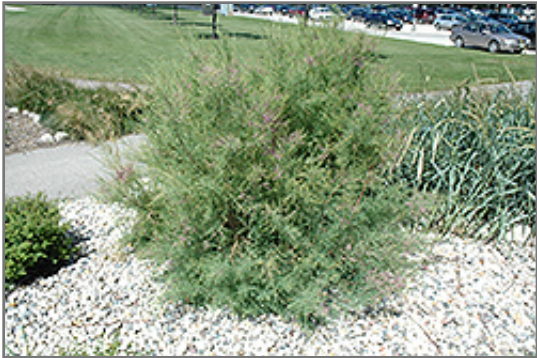
Pink Cascade Tamarisk