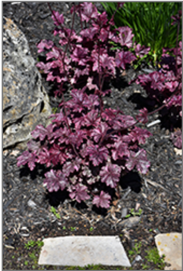
Midnight Rose Coral Bells