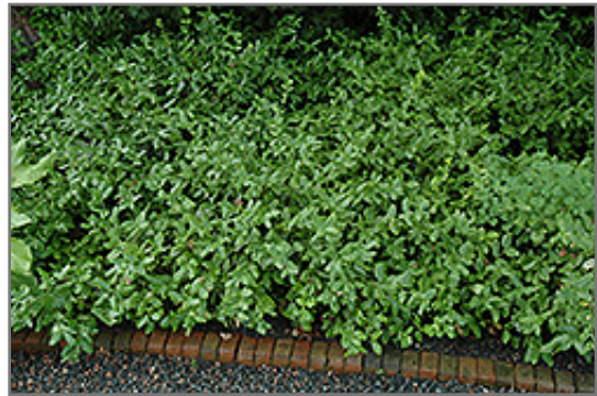
Sarcoxie Wintercreeper

This shrub performs well in both full sun and full shade. It is very adaptable to both dry and moist locations, and should do just fine under average home landscape conditions. It is not particular as to soil type or pH. It is highly tolerant of urban pollution and will even thrive in inner city environments, and will benefit from being planted in a relatively sheltered location. This is a selected variety of a species not originally from North America.