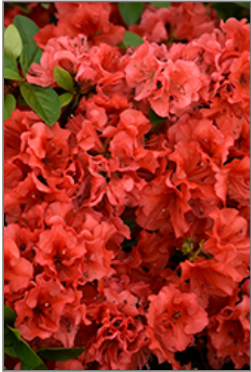
Girard's Hot Shot Azalea flowers