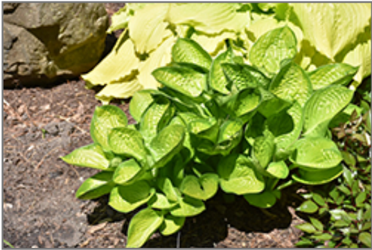
Rainforest Sunrise Hosta